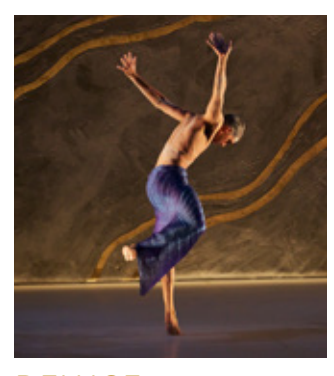
DELUGE Waters begin their journey towards Lake Eyre bringing with it transformation and ensuring the life cycle continues.