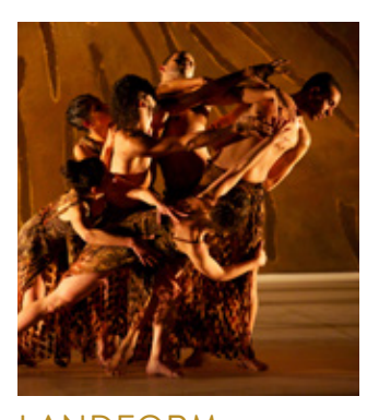
LANDFORM Through each evolution, the land regenerates and heals, awakening the cultural ties that connect people to place.