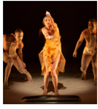
REBORN Land is passed down through the lineage along with knowledge and customs.