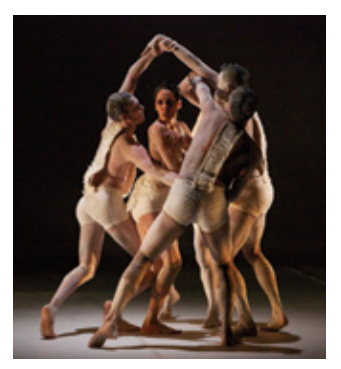
RED BRICK Looking beyond urbanscape to hear an ancestral calling to Country