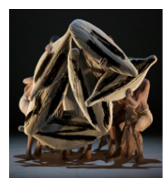
SHIELDS Reflecting on the struggle for Land Rights and Recognition that continues to affect Indigenous people today