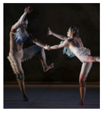
SALT Beyond the white salt vastness lies an abstract landscape that resonates an ancient power