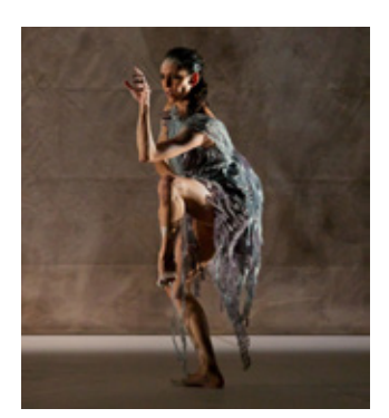
REFLECT Traversing the horizon to glimpse the sacred realm where earth and sky meet