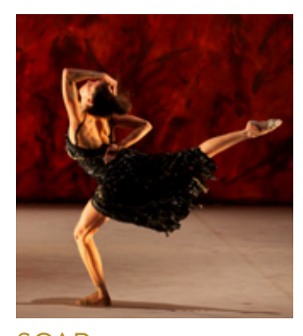
SCAR The impact of man's actions scar and disrupt the delicate balance between man and environment