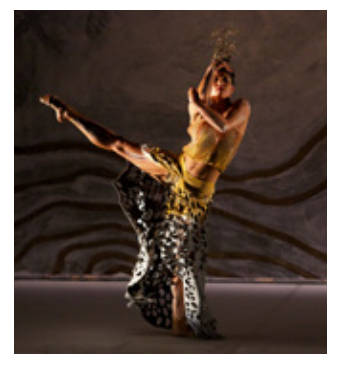
SPINIFEX Inspired by the trees in and around Lake Eyre that resemble the gatherings of spirit women waiting, suspended in time